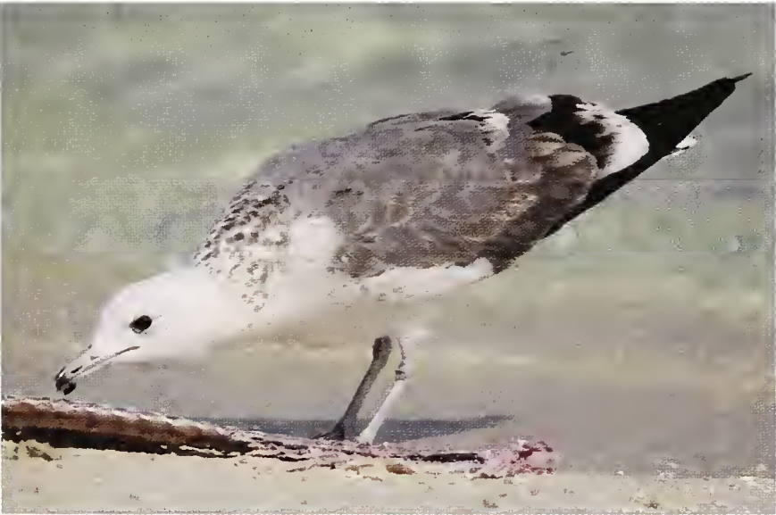
Figure 2. Third calendar-year Steppe Gull Larus (fuscus) barabensis , Dahret Island, 25 October 2008 (Giuseppe De Marchi) Goéland des steppes Larus (fuscus) barabensis de 3e année, île de Dahret, 25 octobre 2008 (Giuseppe De Marchi)